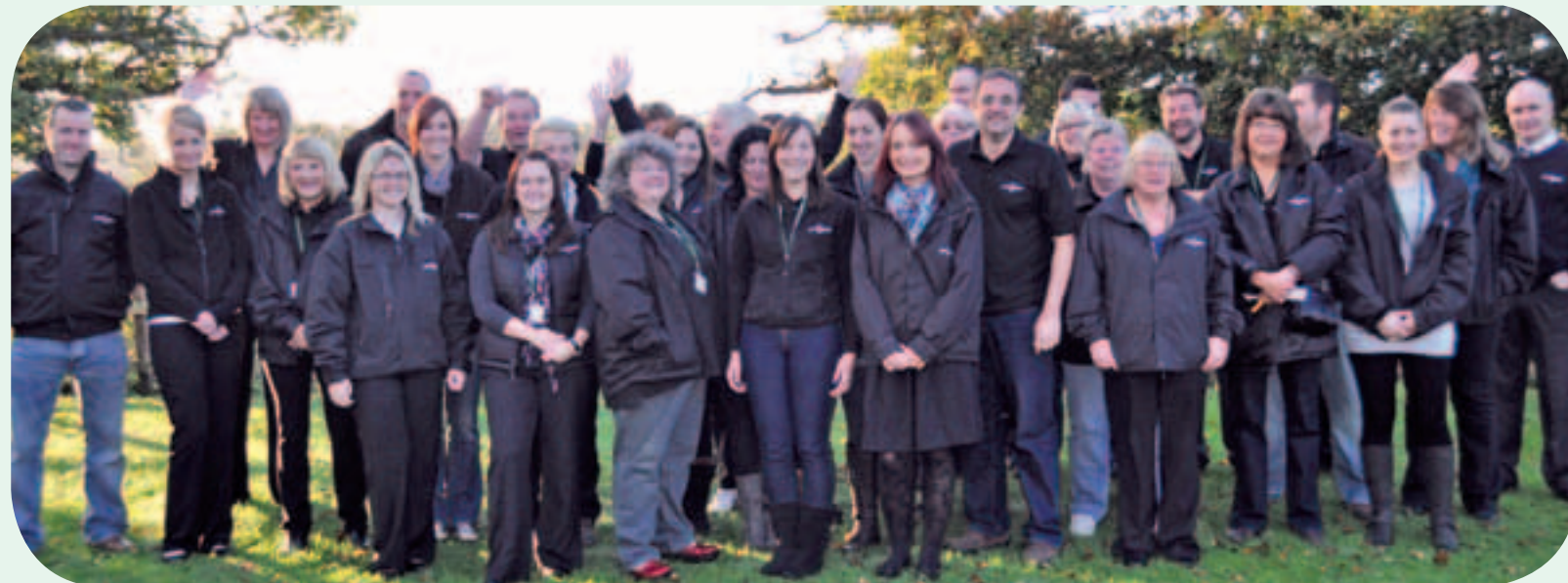
Pictured: Yarlinton staff prepare to set off for their Big Day Out.

Anyone who was not included in the Yarlinton Big Day Out survey who would like to get in touch can contact them on 01935 404500 or email neighbourhood.team@yhg.co.uk